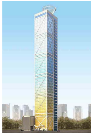
Sunshine Tower Parel (Commercial)