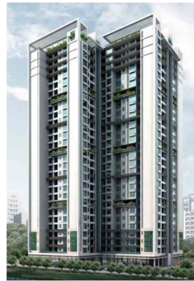
Samriddhi Bhandup West (Residential)