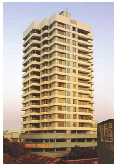
Sunshine Heights Dadar West (Residential)