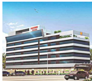
Sunshine Plaza Dadar East (Commercial)