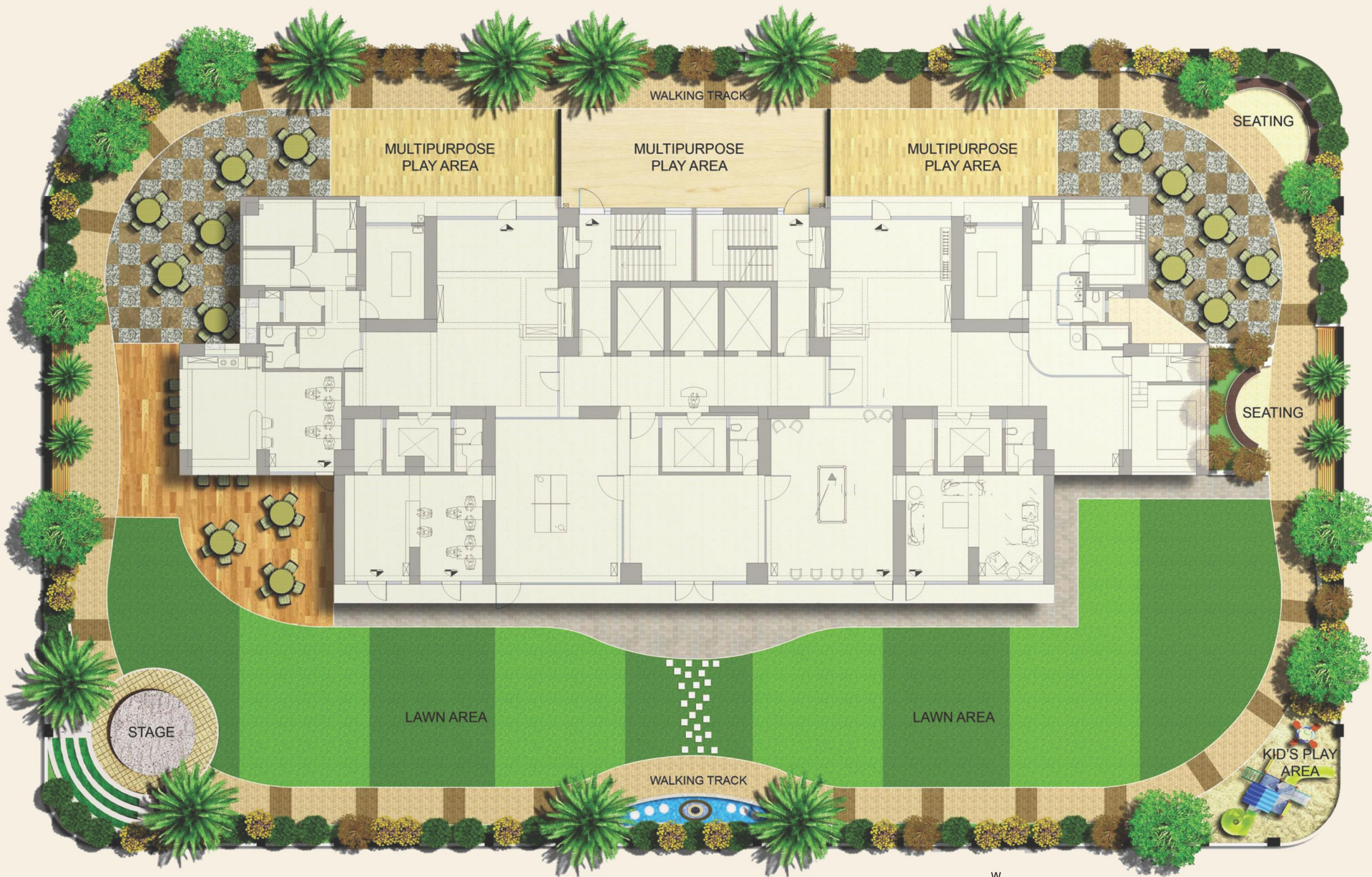
4TH PODIUM FLOOR PLAN