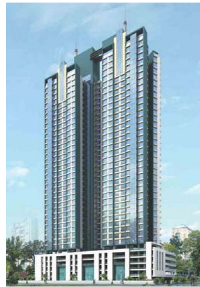
Sunshine Galaxy Goregaon (Residential)