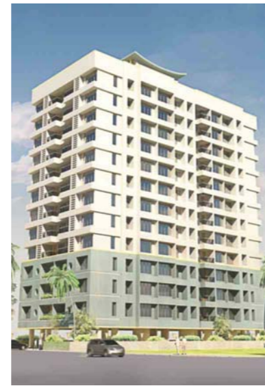
Sunshine Regency Andheri West (Residential)