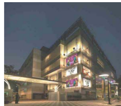
Hi Life Mall Santacruz West (Commercial / Retail)