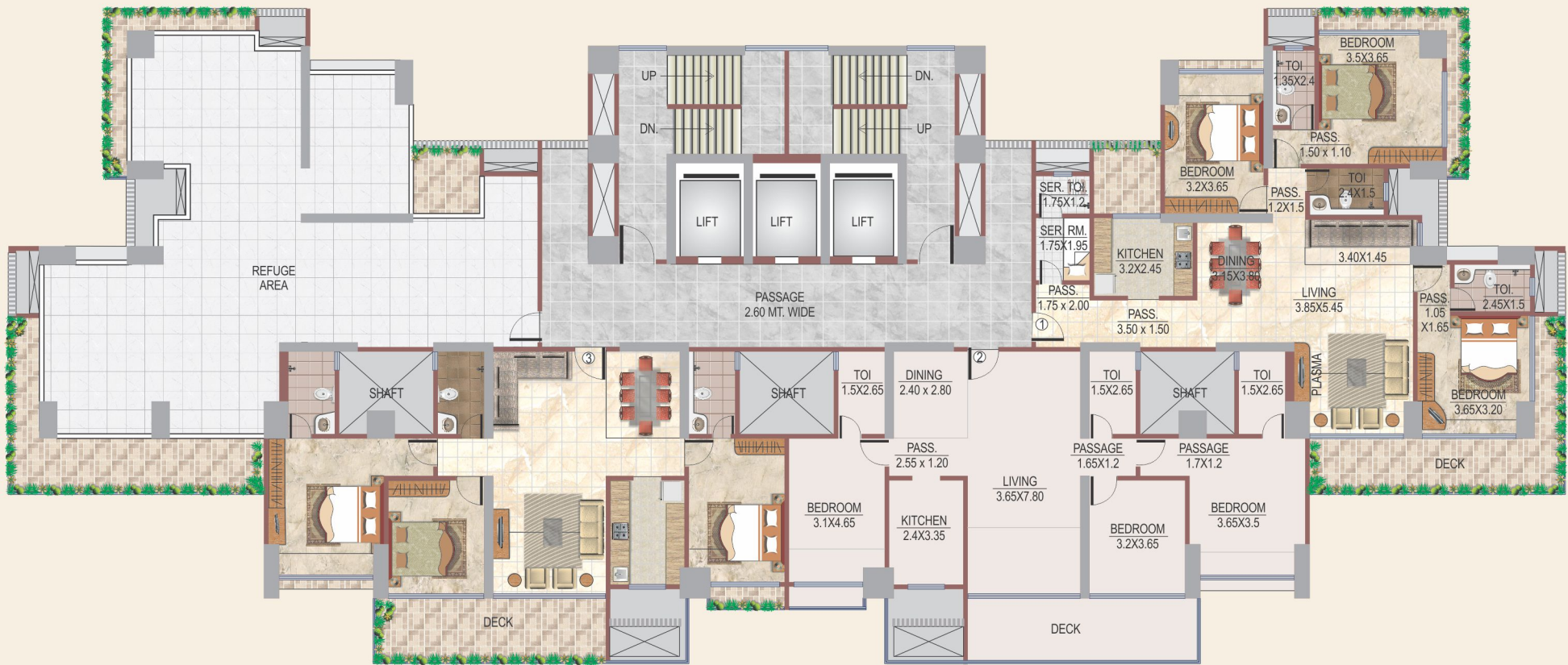
8TH, 13TH, 18TH, AND 23RD FLOOR PLANS