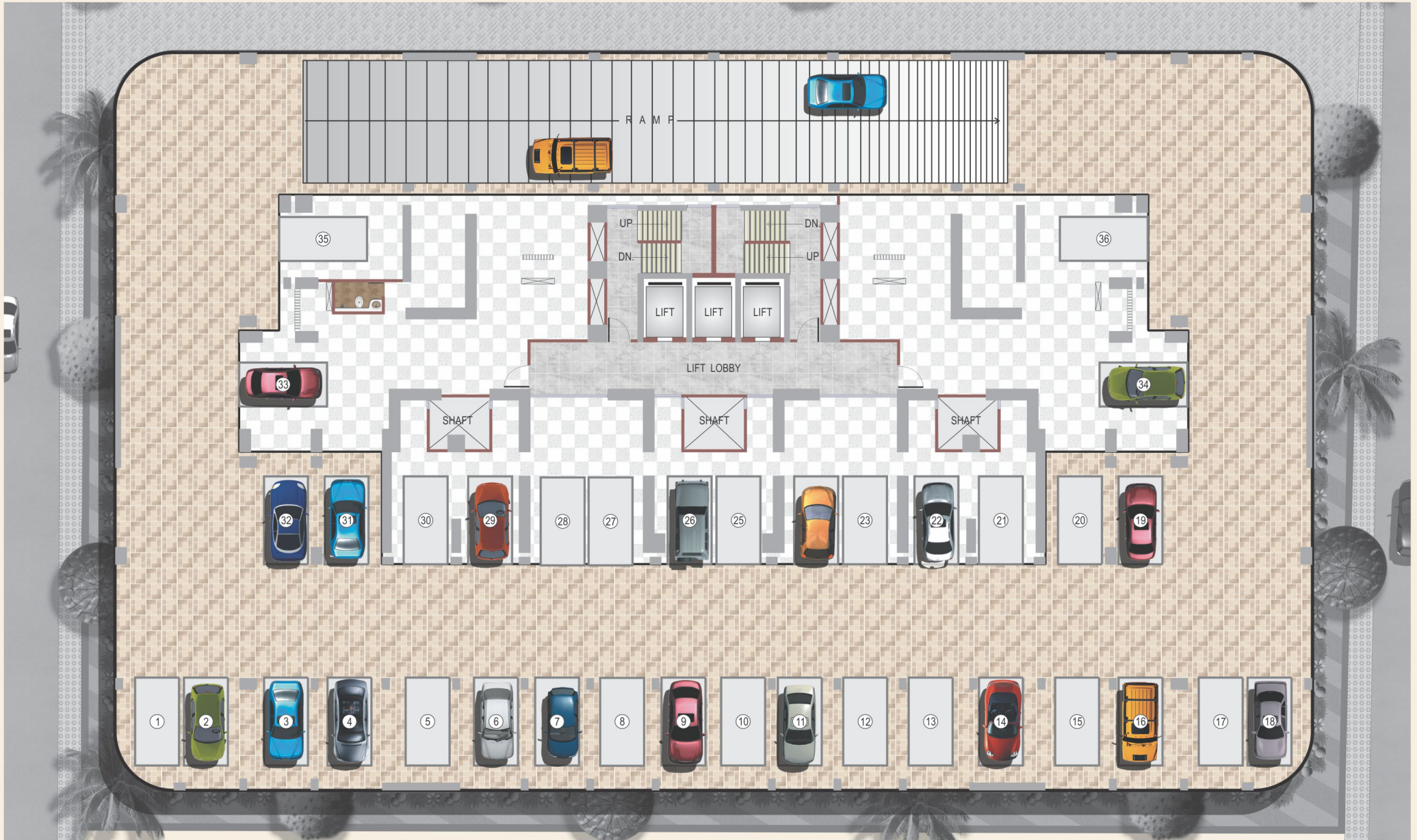
1ST TO 3RD PODIUM LEVEL PLAN